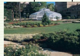
University of Guelph Arboretum